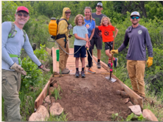
Partners Environmental & Rutsu Team of the Year on Lov Connection