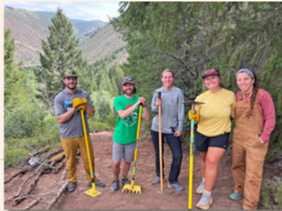
Walking Mountains Most Volunteer Days (6)