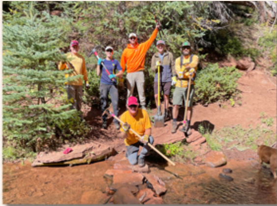
BG Buildingworks Most Volunteer Hours (156)